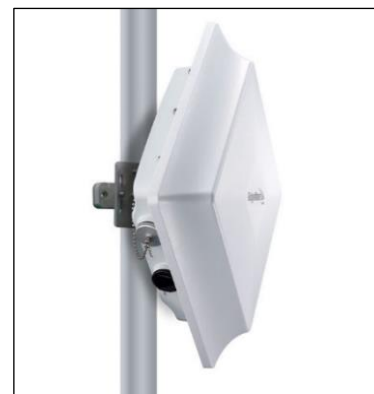
Outdoor Home Units - Customer Premises Equipment (CPE)