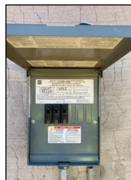
Solar Unit Meter Box