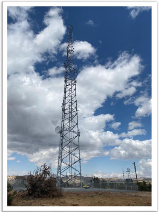
Tower - Pinedale, NM

The land lease is acquired, the engineering completed, and the contracts have been awarded for the tower materials and build with a target completion date of November 30 th . The installation of backhaul, broadcast stations and testing is scheduled to be completed by Dec. 23 rd .