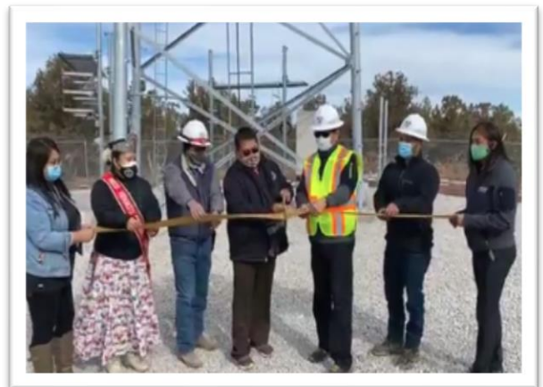
Photo right: On December 22 nd , NN President Jonathan Nez and NN Council Delegate Vince James (both center of photo) cut the ribbon at a small dedication ceremony for the Woodsprings tower.

Construction at the Beclabito (NM) is delayed because of terrain. As crews were drilling the tower foundation, they encountered volcanic rock and it changed our original scheduled. The new target date for completion is January 15 st . The installation of the backhaul/broadcast station is now set for January 22 nd . NTUA has installed a temporary COW (Cellular-on-wheels) to accommodate network traffic until the permanent tower is operational.