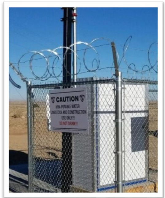
Sheepsprings Livestock Water Loading Station

The Montezuma Creek, UT arsenic removal water treatment plant has been completed and commissioned.